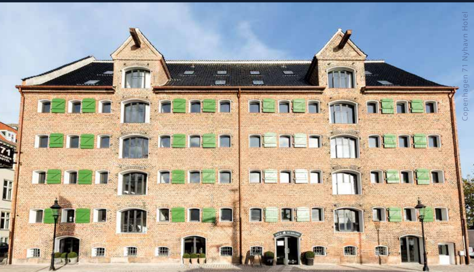
Copenhagen 71 Nyhavn Hotel

Glazing solutions experience built since 1943