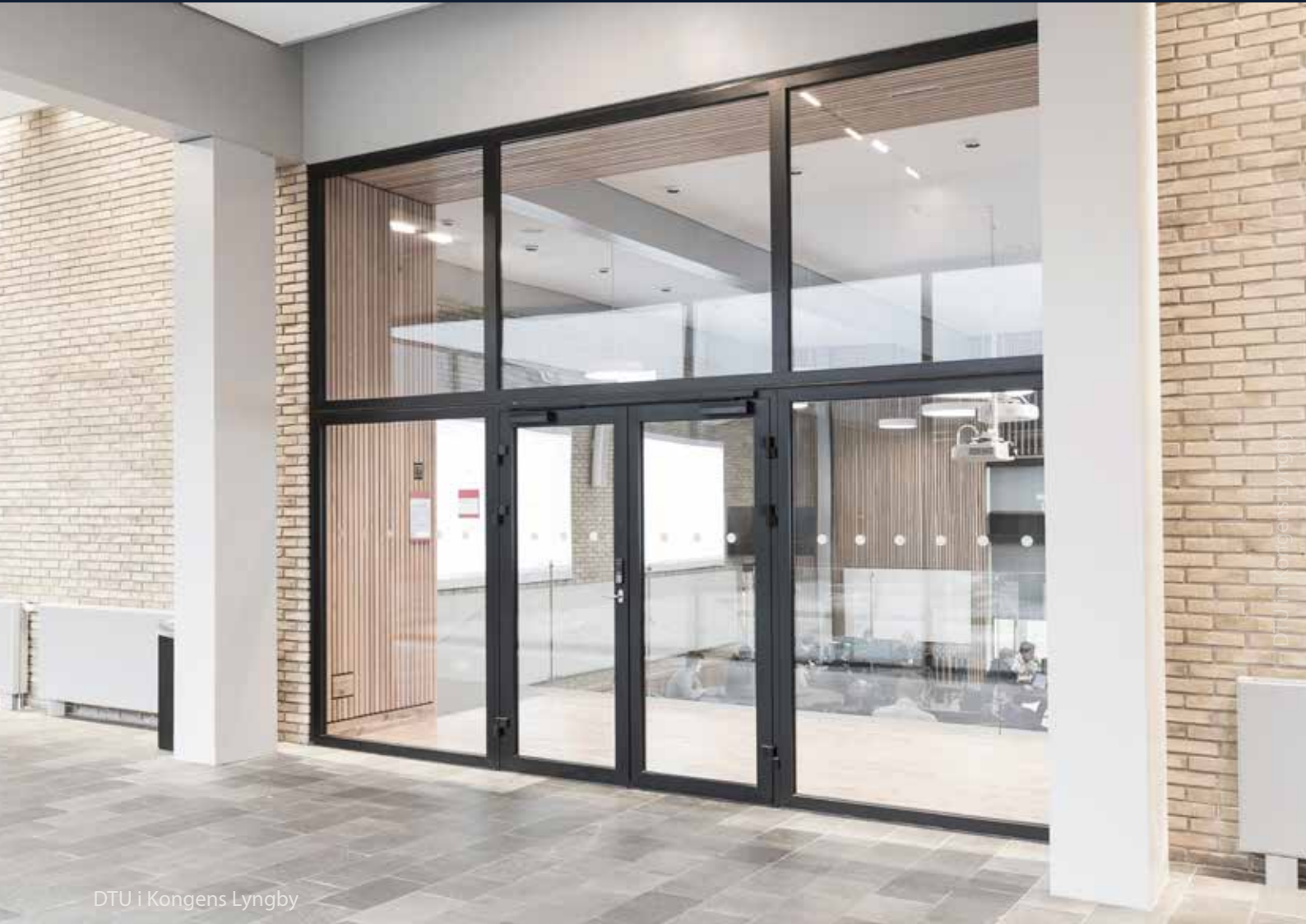
DTU i Kongens Lyngby