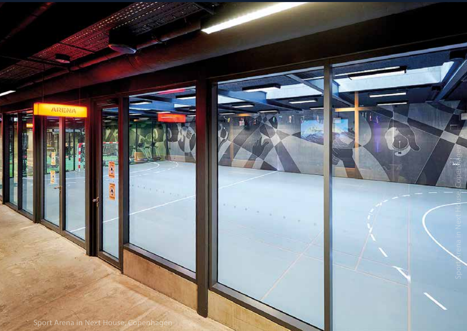
Sport Arena in Next House, Copenhagen