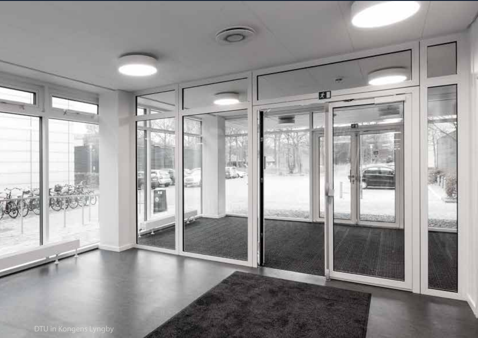
DTU in Kongens Lyngby